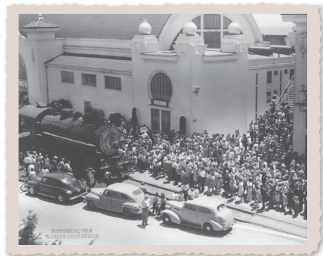
Arrival of the Suntan Special, 1941

Until 1960, Boardwalk visitors stepped off the Suntan Special to the rousing strains of the Beach Band, which greeted each train with blazing brass. Today Roaring Camp Railroads still brings visitors to the Boardwalk through the redwoods from Felton.