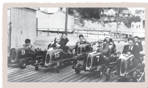
Midget racers, 1928

The Cave Train to the Lost World opened with a prehistoric theme in 1961, built along with an extensive engineered seawall construction project. The Cave Train and the Great Auto Race were both influenced by high-tech rides introduced at Disneyland, the world's newest and most remarkable amusement park of the time. A major renovation project in 1998-99 was implemented to strengthen the Cave Train Plaza; the revamped Cave Train Adventure opened in May 2000.