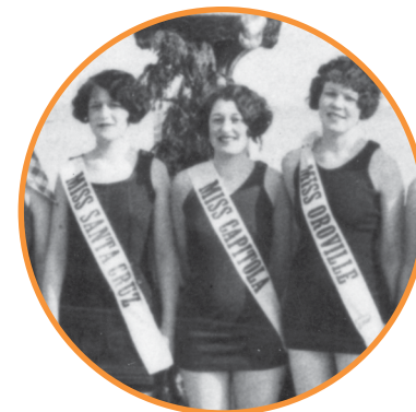
Miss California, 1925

All that changed in the Roaring Twenties. The first Miss California Beauty Pageant took place right here in 1924 and continued into the 1970s. The Hollywood film industry has favored the Santa Cruz Beach as the setting for tales of romance, adventure, intrigue and comedy, and the site has been seen by millions on national television.