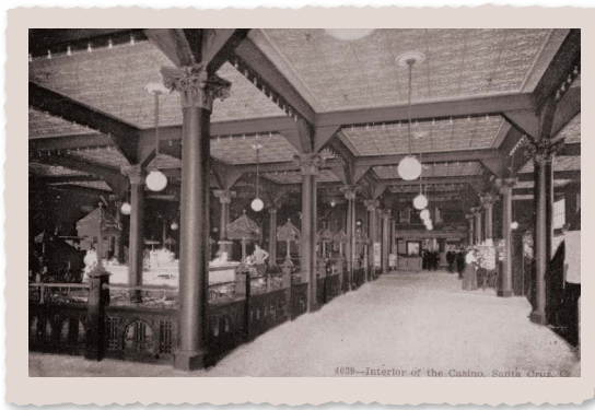
View through arcade and shops, 1907

Walk through the Arcade, toward the beach, and step into the colonnade.