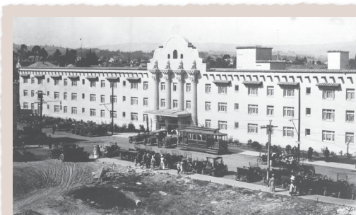
Casa del Rey Hotel, 1911

It enjoyed a long life as a beach convention hotel linked to the Casino by an overhead enclosed