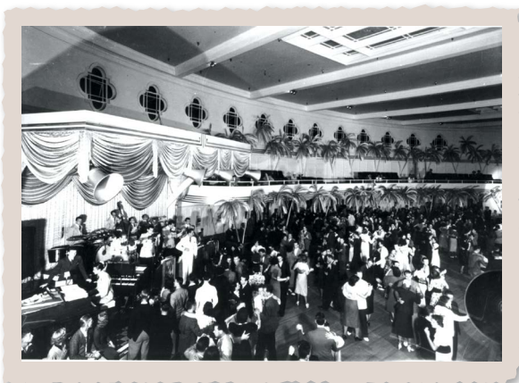
Coconut Grove Ballroom, 1947