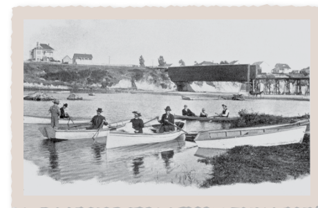
Rowboats on the San Lorenzo, 1895

Neptune's Kingdom, you can get an unobstructed view of the classic wooden structure.