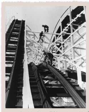
Routine Giant Dipper maintenance at the top, 1959

MPH along 1/2 mile of track and that heart-stopping first hill is a 70-foot drop. Coaster mechanics walk the track to inspect the ride many times daily. The braking system, track, and cars have all been updated with the latest in ride safety technology.