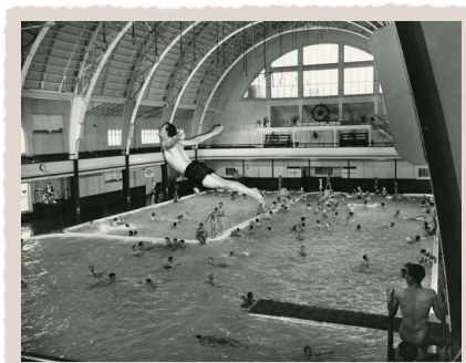
Santa Cruz Plunge, 1946

Next, walk past Roll-A-Bingo and turn to the left to see photographs of the famous salt-water Plunge, the scene of death-defying water carnival acts, and record-setting swim competitions. For over 50 years, nearly every kid in Santa Cruz learned to swim here, until excessive repairs forced closure of the aging pool.