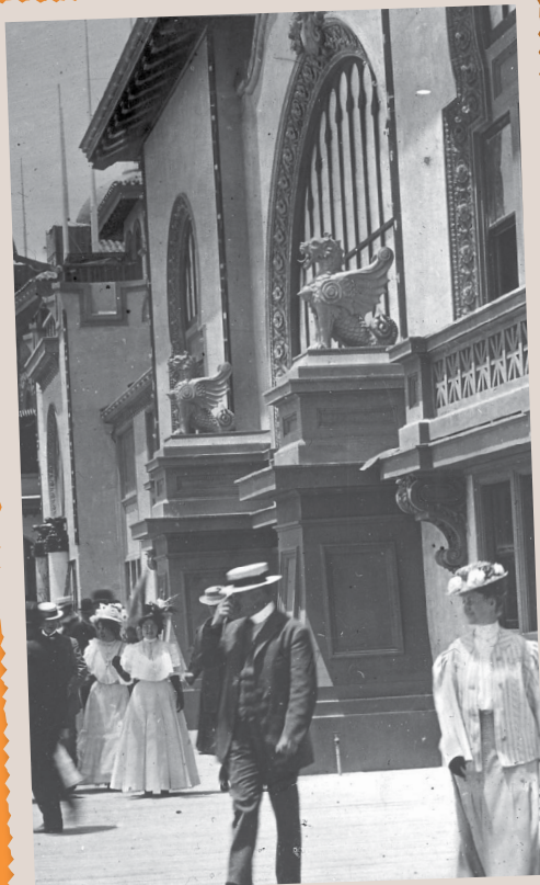
Santa Cruz Casino and Natatorium, circa 1907