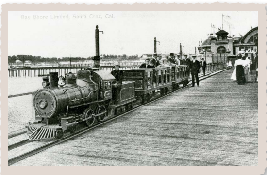
Coastline Railroad, 1909

popular train ride was replaced by the Sun Tan Jr. steam train, then the City of Santa Cruz streamliner, which ran from 1938 until the beginning of WWII.