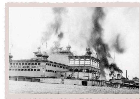
Neptune Casino fire, June 22, 1906

burned to the ground in a fire that started in the Casino Restaurant on June 22, 1906.