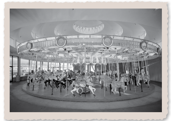
Loeff Carousel, 1968

The Loeff horses are identifiable by their jeweled saddles and bridles, elaborately carved flowing manes, slender prancing legs, and by intricate carvings beneath the cantle of the saddle. Look for angels and cherubs, pomegranates, and rabbits. Loeff was the first carousel designer to add lights as decoration, dazzling the riders with his brilliant displays. The Loeff horses are now very rare—none were made after 1918. The carousel even has a mechanical ring machine, one of only a handful left in the country. The carousel is a National Historic Landmark—an honor awarded only to historic places that have contributed substantially to the engineering, architectural, and cultural history of the nation.