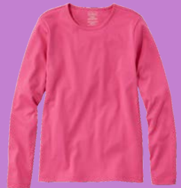
Not black or white