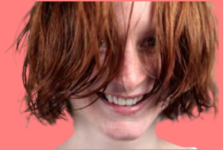
Hair is messy, cannot clearly see eyes