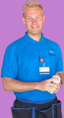
Tucked in, clean, ID card visible