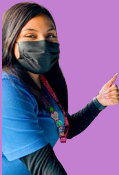
Black long sleeved shirt