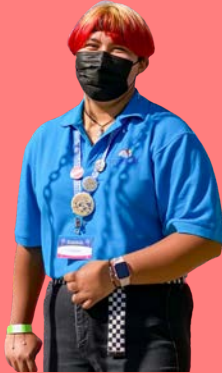
Semi-permanent or permanent dye