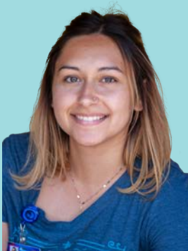
Nose stud, safe necklace