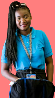
Long hair tied back and tidy